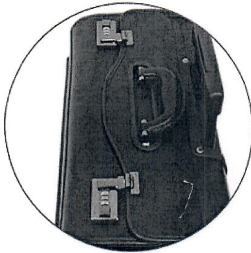
Dual Combination Lock